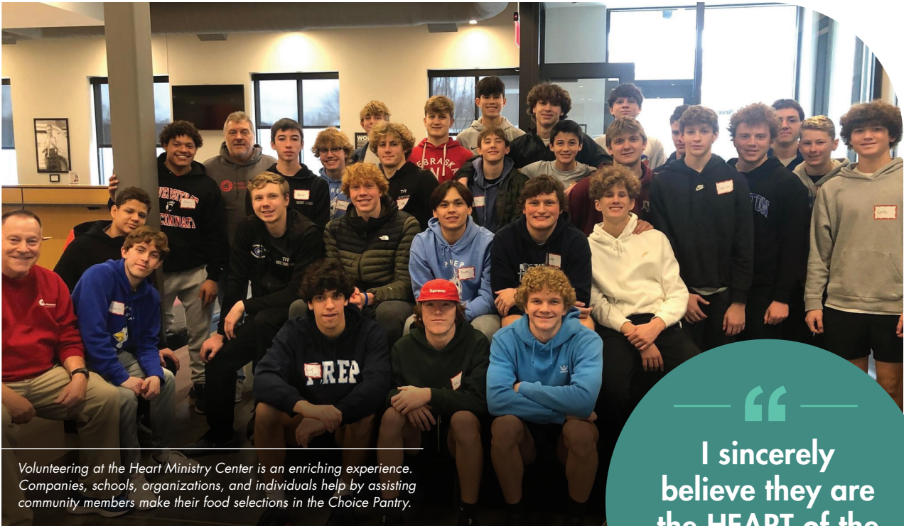
Volunteering at the Heart Ministry Center is an enriching experience. Companies, schools, organizations, and individuals help by assisting community members make their food selections in the Choice Pantry.